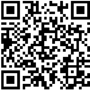
A3 Black & White